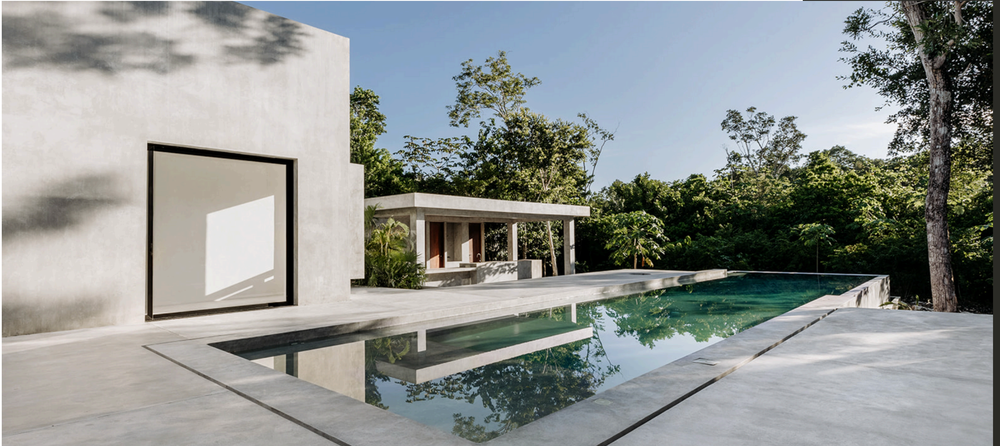
HEATED POOL WITH JUNGLE VIEWS