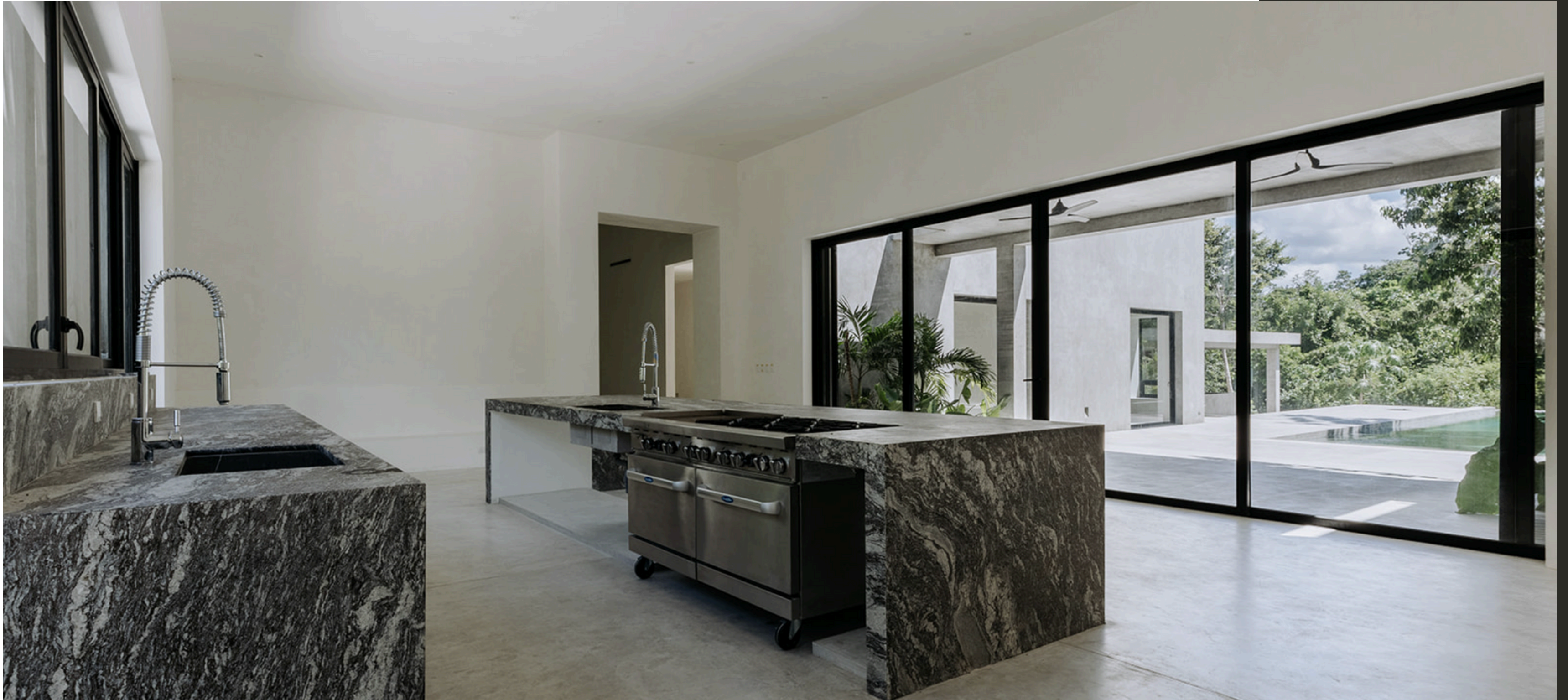
SOPHISTICATED OPEN PLAN KITCHEN —————