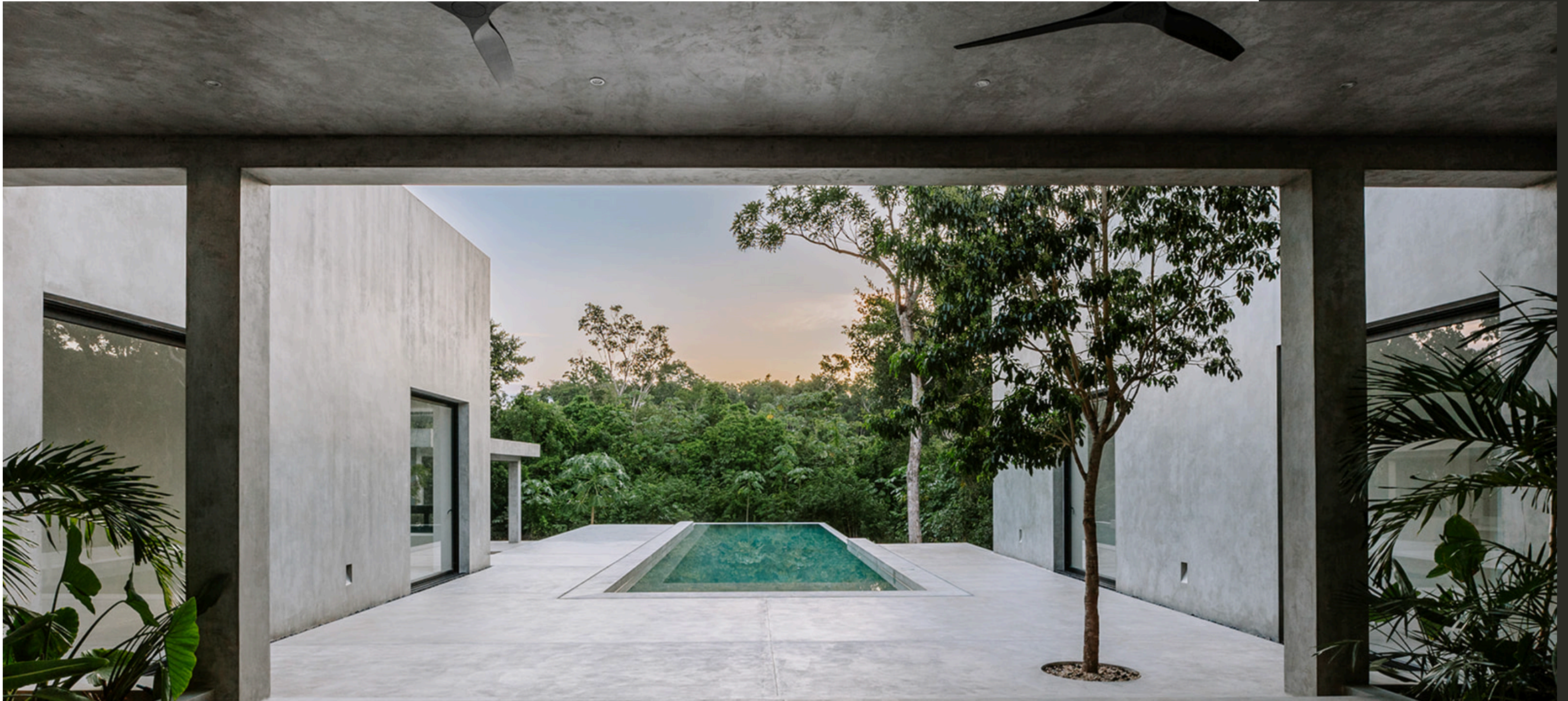
KITCHEN POOL VIEW