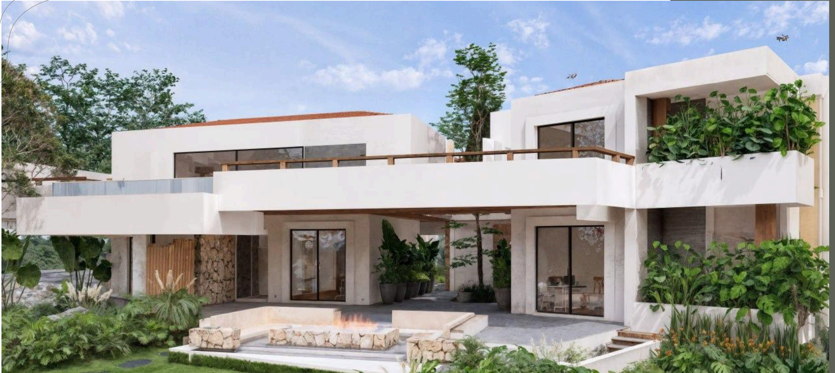
COURTYARD WITH OCEAN VIEW FIREPIT