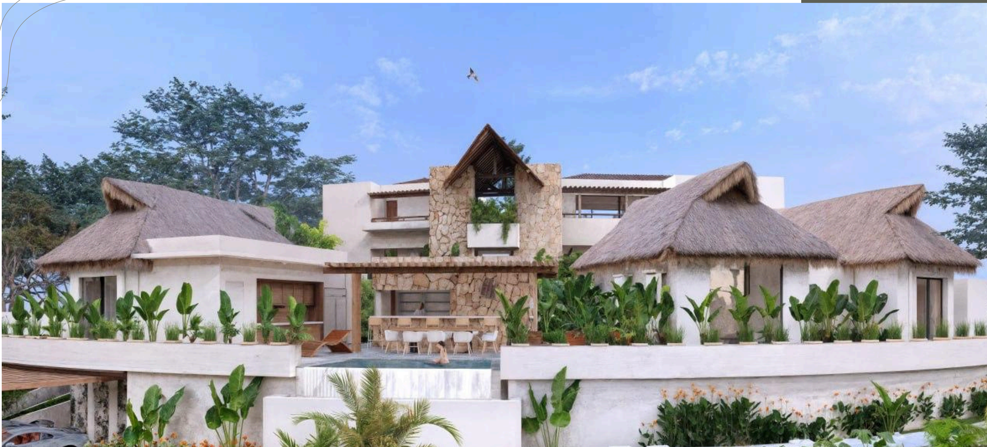
OCEAN VIEW POOL & GOURMET BAR