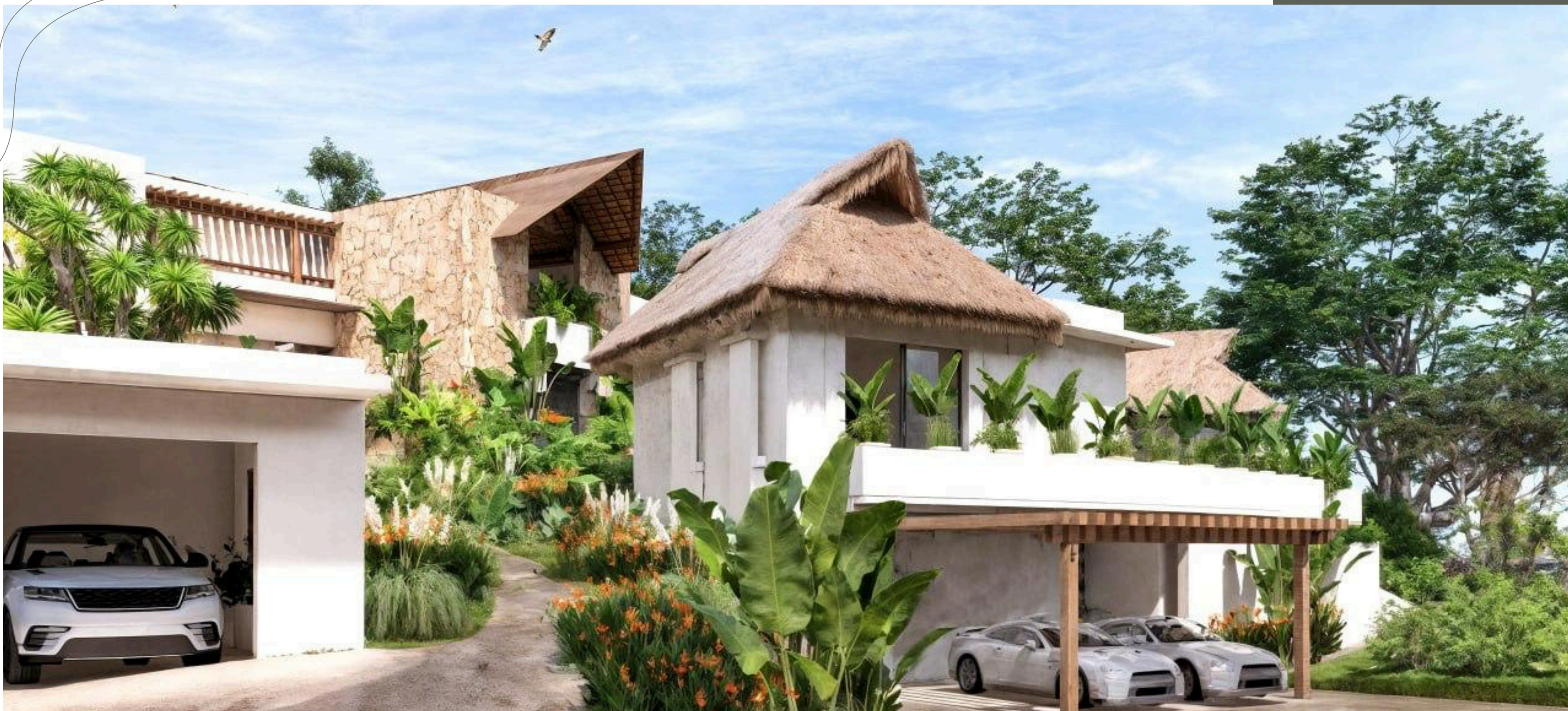
FIVE-CAR COVERED PARKING AREA